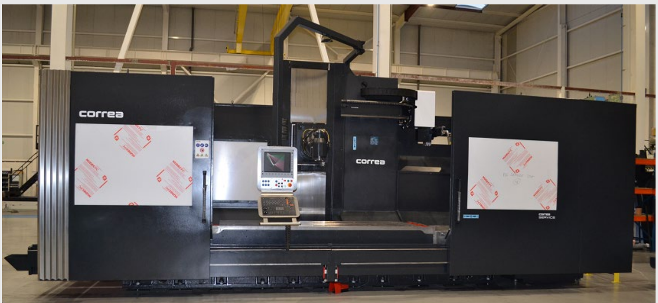
CORREA CF25/25 with new ATC-30 and option of new auto-indexing head (UDG)